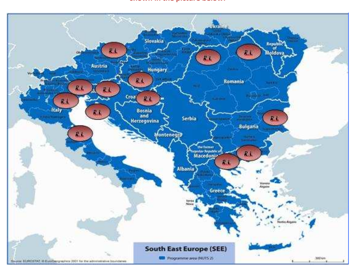
The 13 Regional Laboratories of Innovation key actors established in the South East Europe Area shown in the picture below:

R.L = Regional Laboratories of Innovation Key actors